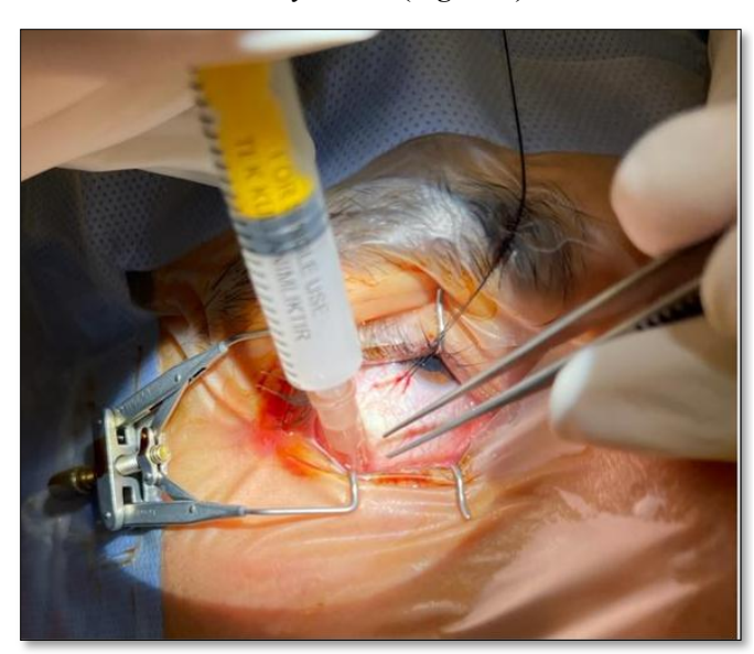
Figure 3. Subtenon implantation technique: A small cut 10 mm away from the limbus was made through the conjunctiva and tenon capsule in the infero-temporal quadrant. A curved subtenon cannula attached to the syringe containing stem cells was inserted through the cut, and forwarded into the extraocular muscle conus.

Subtenon implantation: A small cut 10 mm away from the limbus was made through the conjunctiva and tenon capsule in the infero-temporal quadrant. A curved subtenon cannula attached to the syringe containing stem cells was inserted through the cut, and forwarded into the extraocular muscle conus. Stem cells was then injected through the cannula and insertion site was pressed with a sponge to prevent the leakage. Subsequently, the conjunctiva and tenon were sutured with an 8/0 vicryl suture ( Figure 3 ).